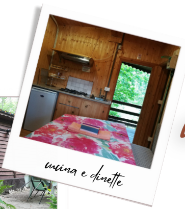
cucina e dinette