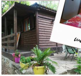
struttura in legno